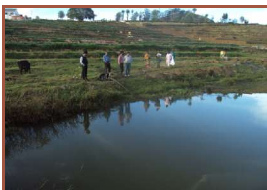
Newly formed bench terraces with surface pond for surface and subsurface water harvesting