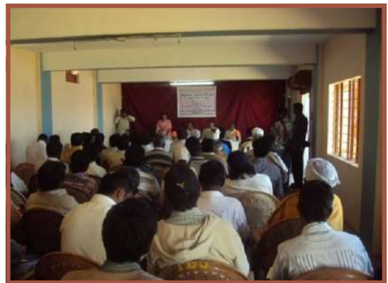
Scientists-farmers interaction meet