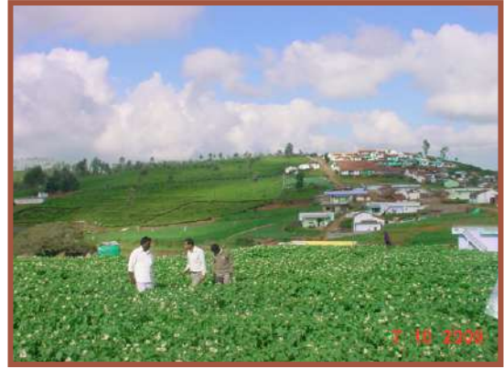
Vatex beans and potato crops under INM demonstration