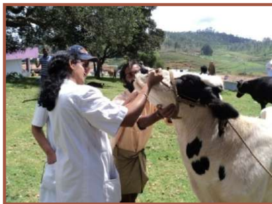
Animal health camp