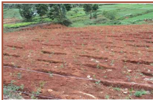
Contour staggered trenches in new tea plantation