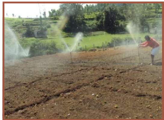
Introduction of sprinkler irrigation