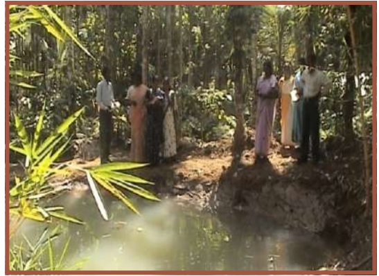
Exposure visit for stakeholders