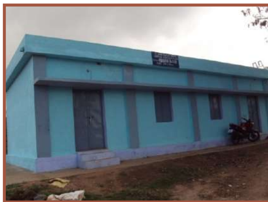
Interventions carried out through convergence approach