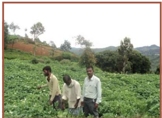
SHG for coffee grinding and vegetable cultivation in Iduhatti watershed capacity building