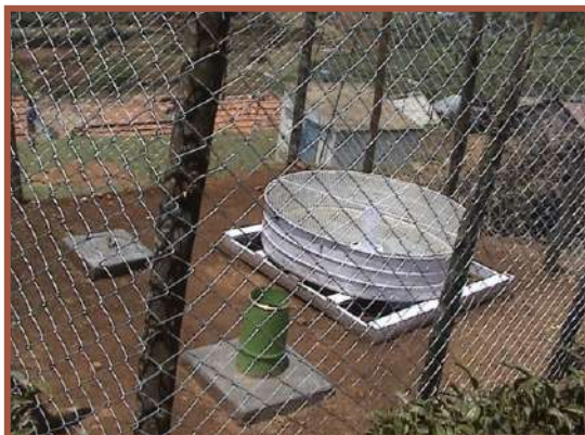
Meteorological observatory installed in Iduhatti watershed