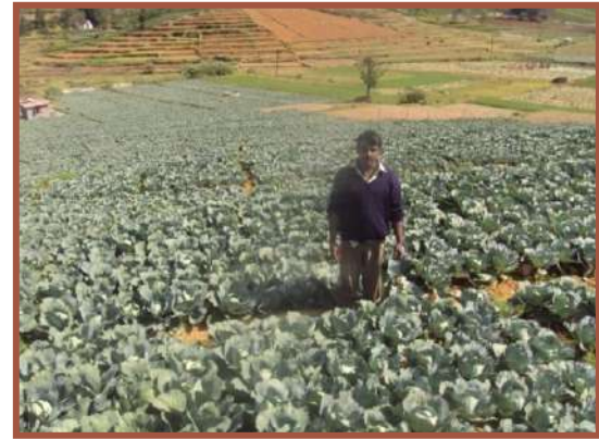
Carrot and cabbage crops under INM demonstration