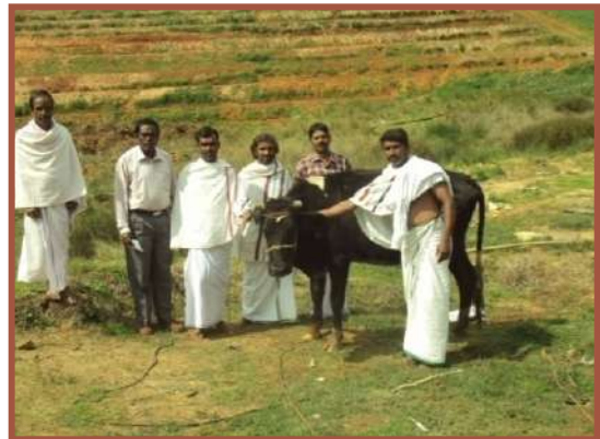
Tribal SHGs for blacksmith and cow rearing