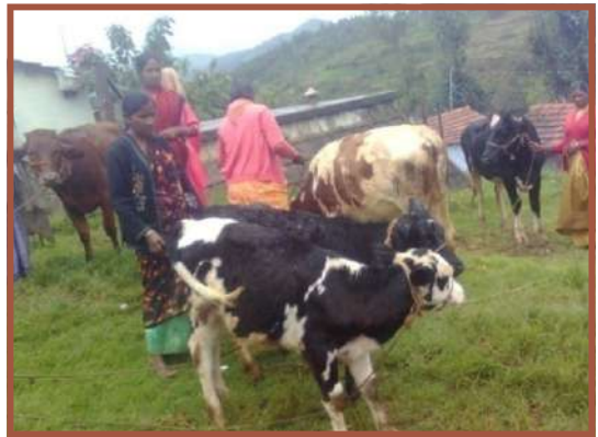
Women SHGs for sheep and cow rearing