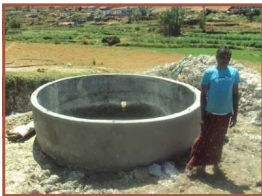
Installation of collection wells