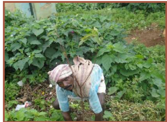
Introduction of fruit plants in home stead gardens