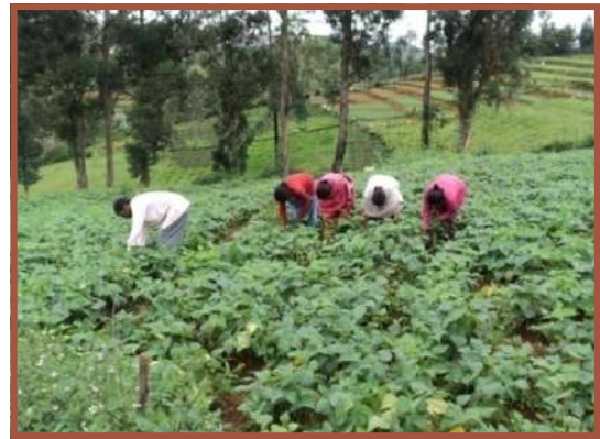
Women SHGs for tailoring and vegetable cultivation