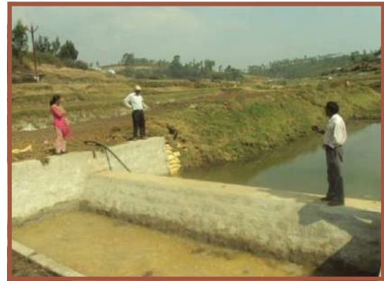
Construction and renovation of check dams