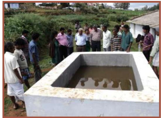
Renovation of cattle shed and construction of water tank