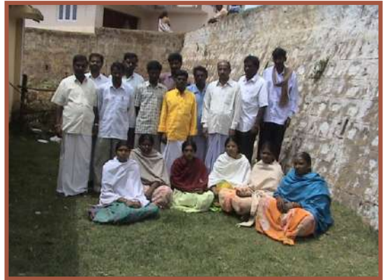
Formation of VRMCs and executive committee for Iduhatti watershed association