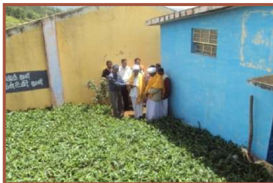
Introduction of improved tea clones