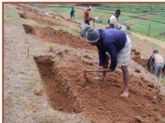
Trenching activity taken up by village community for new tea plantation developed as community resource