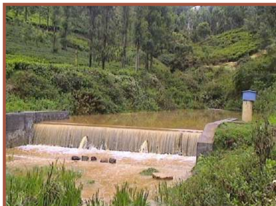
Runoff gauging station