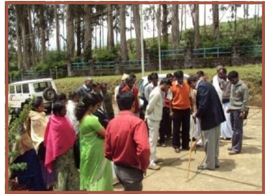
Training programme for stakeholders