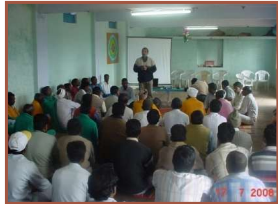
User groups formed