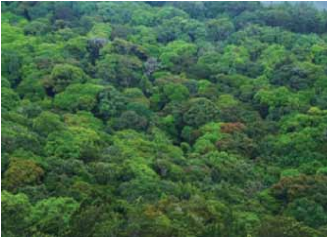
Shola ecosystem in Kodaikanal Wildlife Sanctuary

tourism too are playing an important role in the loss of plant bio-diversity.