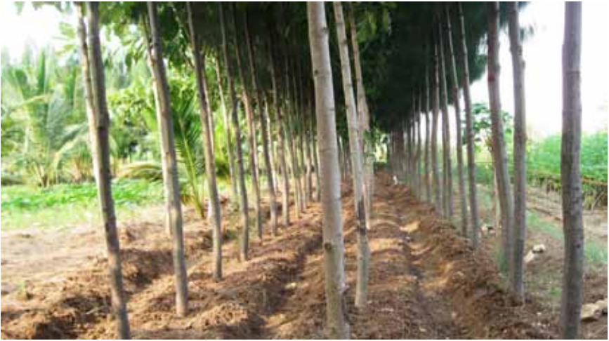
Plate 1: Growth of teak in the middle row (Age: 3 years) with windbreaks of Casuarina in Puthinampatty village, Trichy district of Tamil Nadu

This new approach of growing teak trees along with Casuarina windbreaks favours better growth of height in teak, particularly in bund planting system and in windy localities. Self pruning of branches in teak tree in the mid of Casuarina windbreaks helps to produce clean boles of teak without knots which will fetch a good price. Further research on mixed planting of teak and Casuarina in large scale block plantations will pave a way for enhancing quantitative and qualitative production of teak wood in the country.